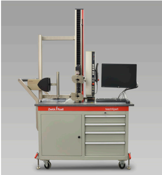
teachXpert (similar product shown)